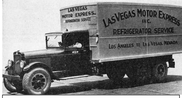
This Reo Speedwagon, traversing the most severe express route in Southern California, covers 600 miles three times a week with six to seven ton loads

The three-ton six-wheel Reo which, with the specially built body, weighs six tons net, leaves Los Angeles at 5 o'clock in the afternoon, taking a cargo averaging between six and seven tons. At San Bernardino the truck is re-iced, the amount depending upon the character and condition of the shipment. But for the remainder of the journey no more re-icing is done.